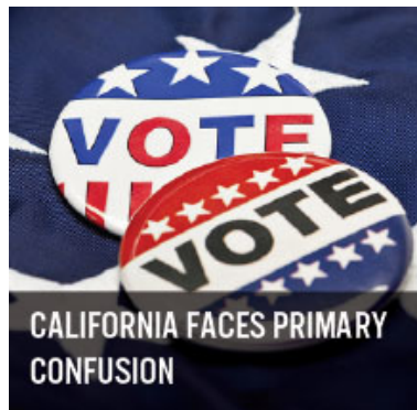
CALIFORNIA FACES PRIMARY CONFUSION