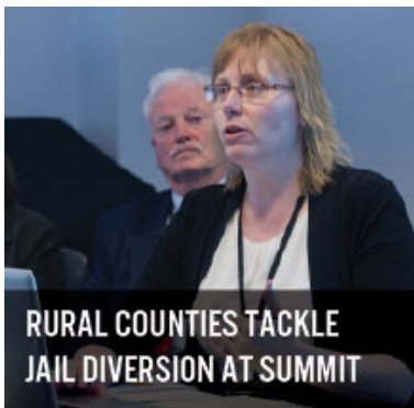
RURAL COUNTIES TACKLE JAIL DIVERSION AT SUMMIT