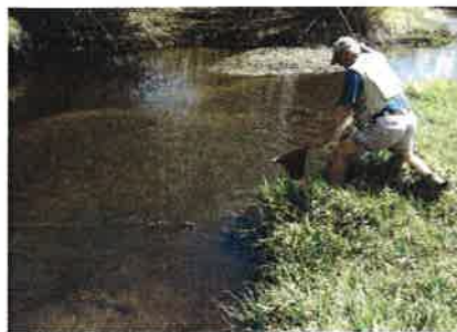
Mammoth Creek doesn't always open in frigid, snowy conditions. Shirt sleeves and shorts worked well for 2013 anglers.

(530) 477-8426 www.unclesharkeyswoodworks.com