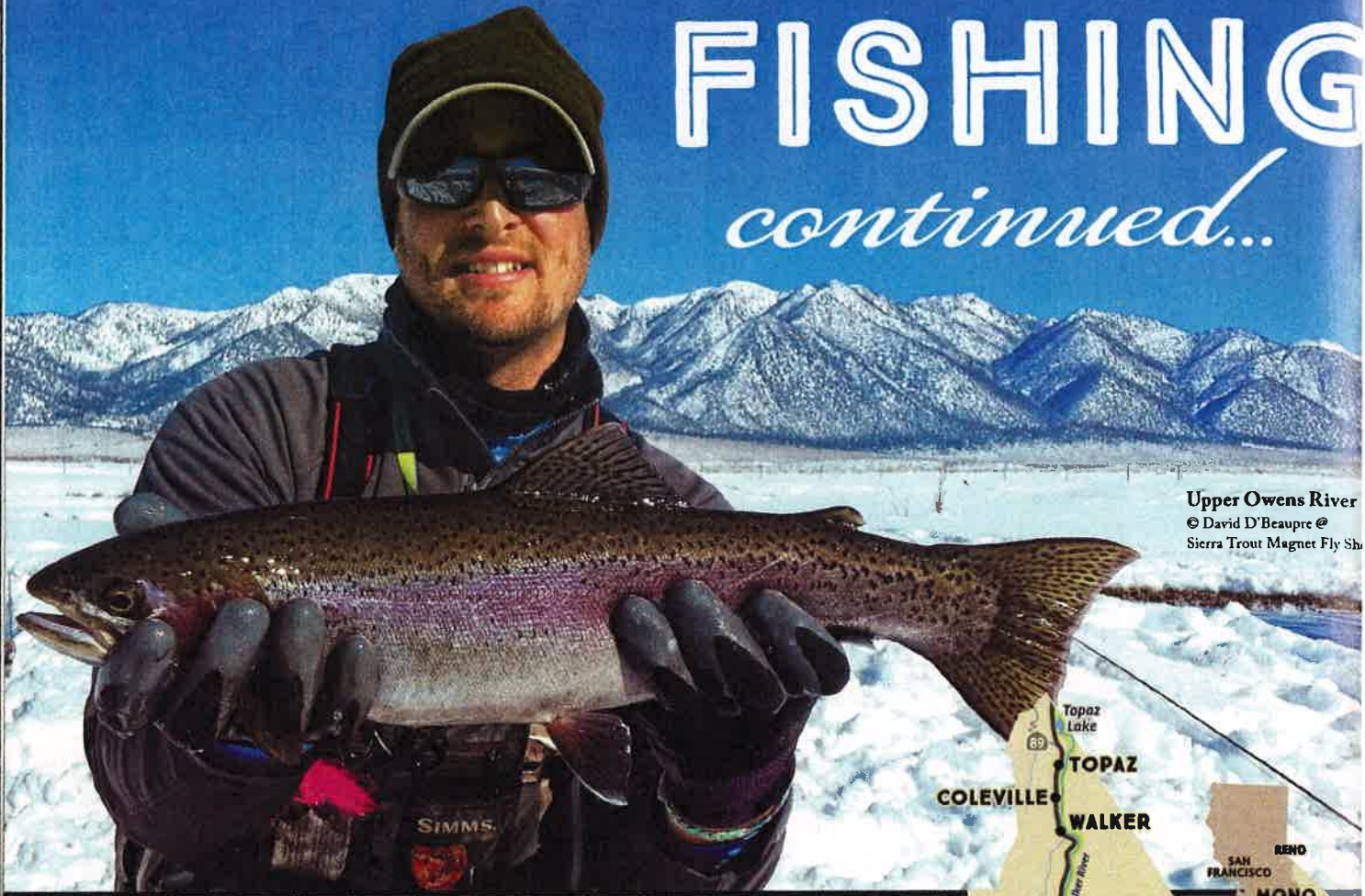
Upper Owens River

WINTER FISHING continues in Mono County until April 24, 2015 along some sections of the West Walker River, East Walker River, Owens River and Hot Creek (see map). Hire a professional fishing guide to get the most out of your excursion! Special catch-and-release regulations apply.