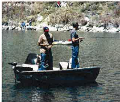
Convict Lake anglers are counting down the days until late April's first casts. What no one will know until then is how the weather will impact opening weekend.